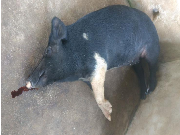
Oozing out of blood from nostril in pig