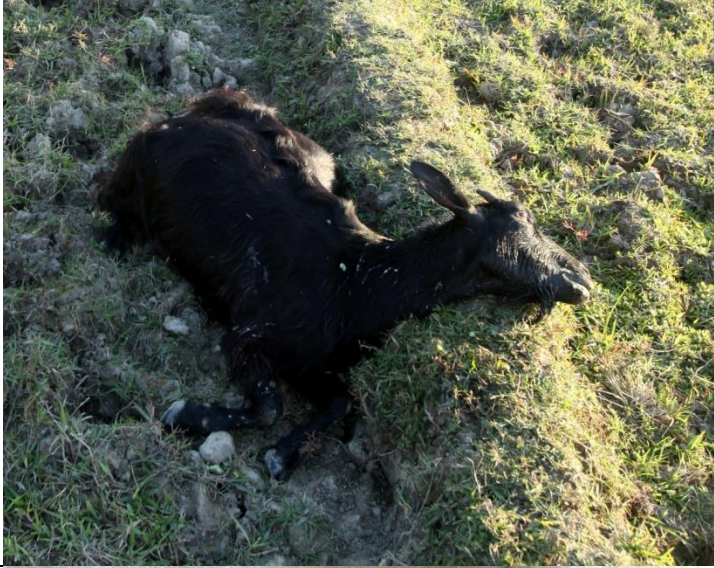
Frothy saliva with tympany and sudden death in goat